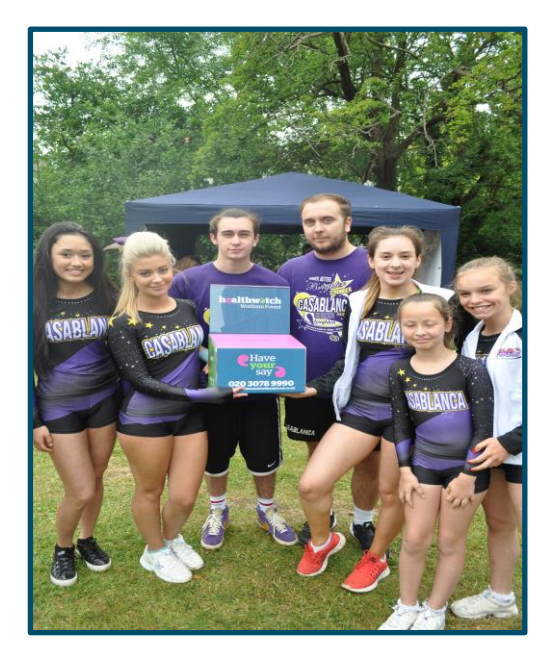
We spoke to young people at Chingford Village Festival

The conversations that took place were very insightful in offering real lived experiences of services and offered potential areas for consideration in improving services for LACs.