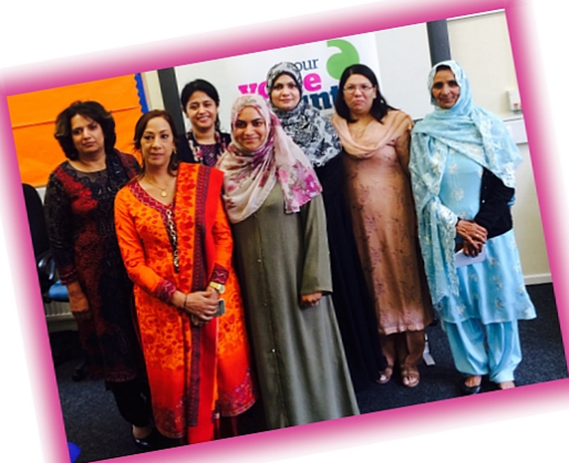
A small, 'but vocal' group!

Healthwatch England has been doing a national tour asking about experiences of Primary Care. For the second time in the series we held a focus group and got together seven Pakistani Women.