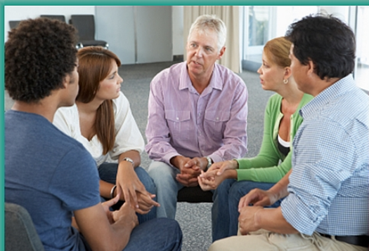
The new integrated drug and alcohol service

The service will support all people using any type of drug or alcohol at any level from prevention and early engagement through to recovery.