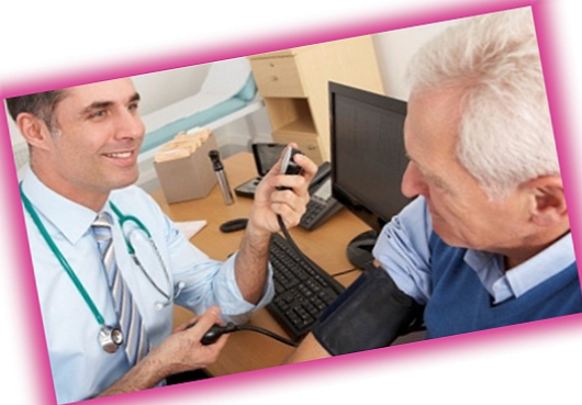
Comments suggest patient sentiment has improved

We found that sentiment around GP services has improved by 4% year-on-year, which is a welcome development. Of course there are still major issues to tackle, such as the ability to get appointments, but even here we have seen an improvement of 3% in sentiment over the year.