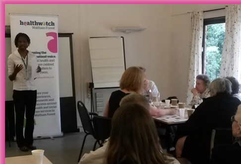
A 'vibrant discussion' about weight management

We recently held a focus group in partnership with Public Health and the Disability Resource Centre for residents aged over 60 years to inform new weight management services. Public Health heard from sixteen people about how they currently access leisure services and healthy foods in order to manage their weight.