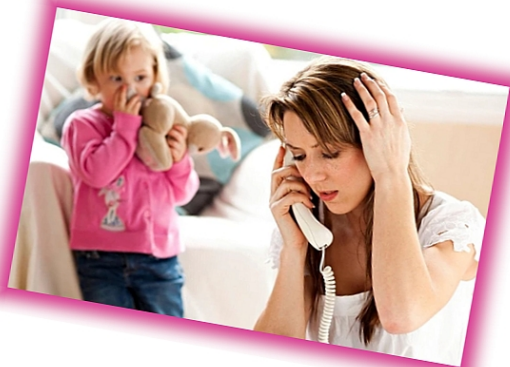
Getting through on the phone is not always easy

We have also heard about poor experience of administrative processes, with almost 800 issues detected this year, including letters containing inaccuracies or arriving after appointments, and patients who attended their appointment later receiving did-not-attend notices, and discharged. It has also been difficult for many patients to get through on the phone.