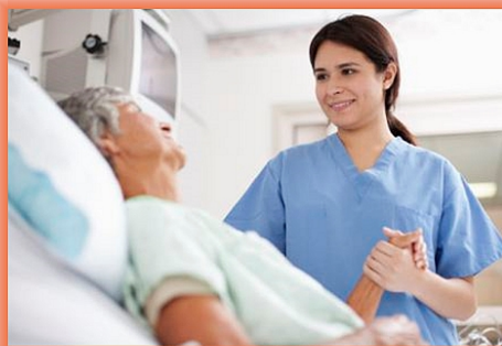
The 'Gold Standard' is a new patient charter

The Gold Standard was initially developed in 2014 through feedback from patients, their carers, their families and with hospital staff at Whipps Cross Hospital.